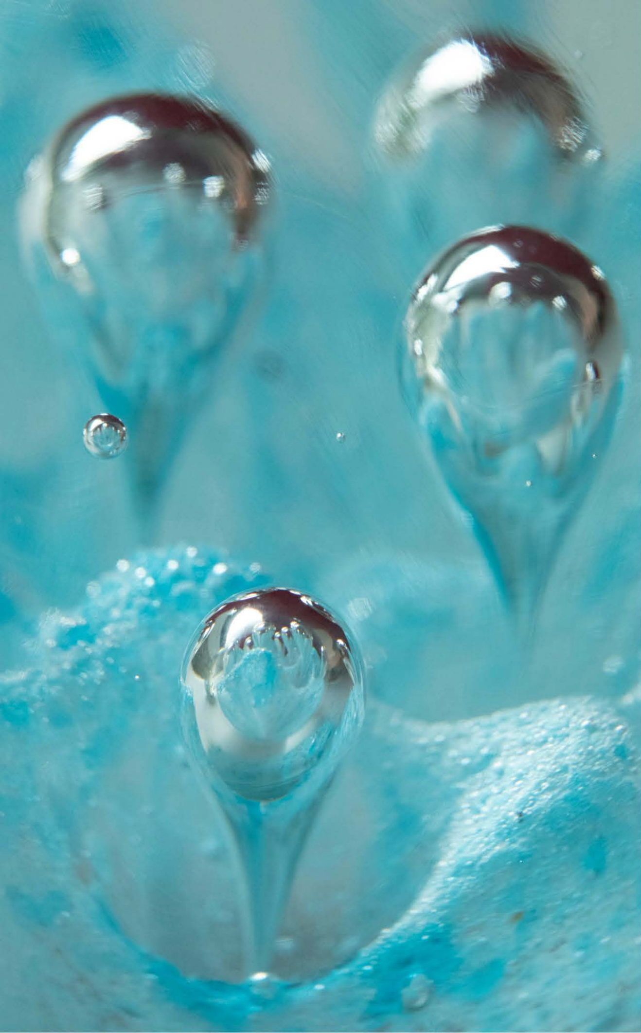
Time Capsules S1_03 - Digital Macro Photography, Archival Pigment Inkjet Print, 58X36cm, 2022