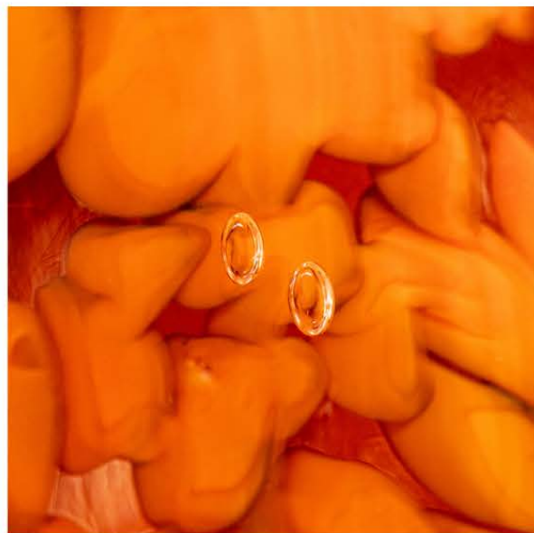
Time Capsules S9_05 2022 Digital Macro Photography Archival Pigment Inkjet Print 40X40cm