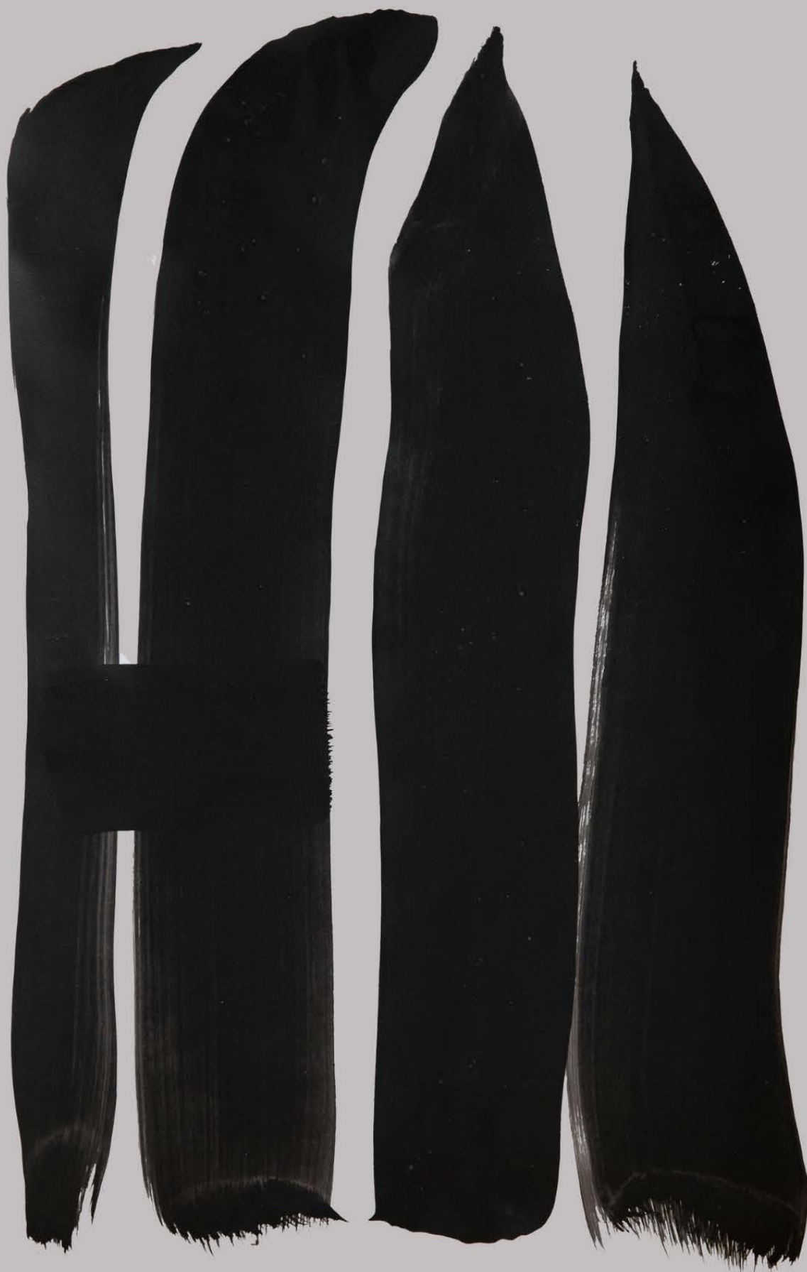
George Chaushba | Untitled, Acrylic on paper, 60x40, 2021