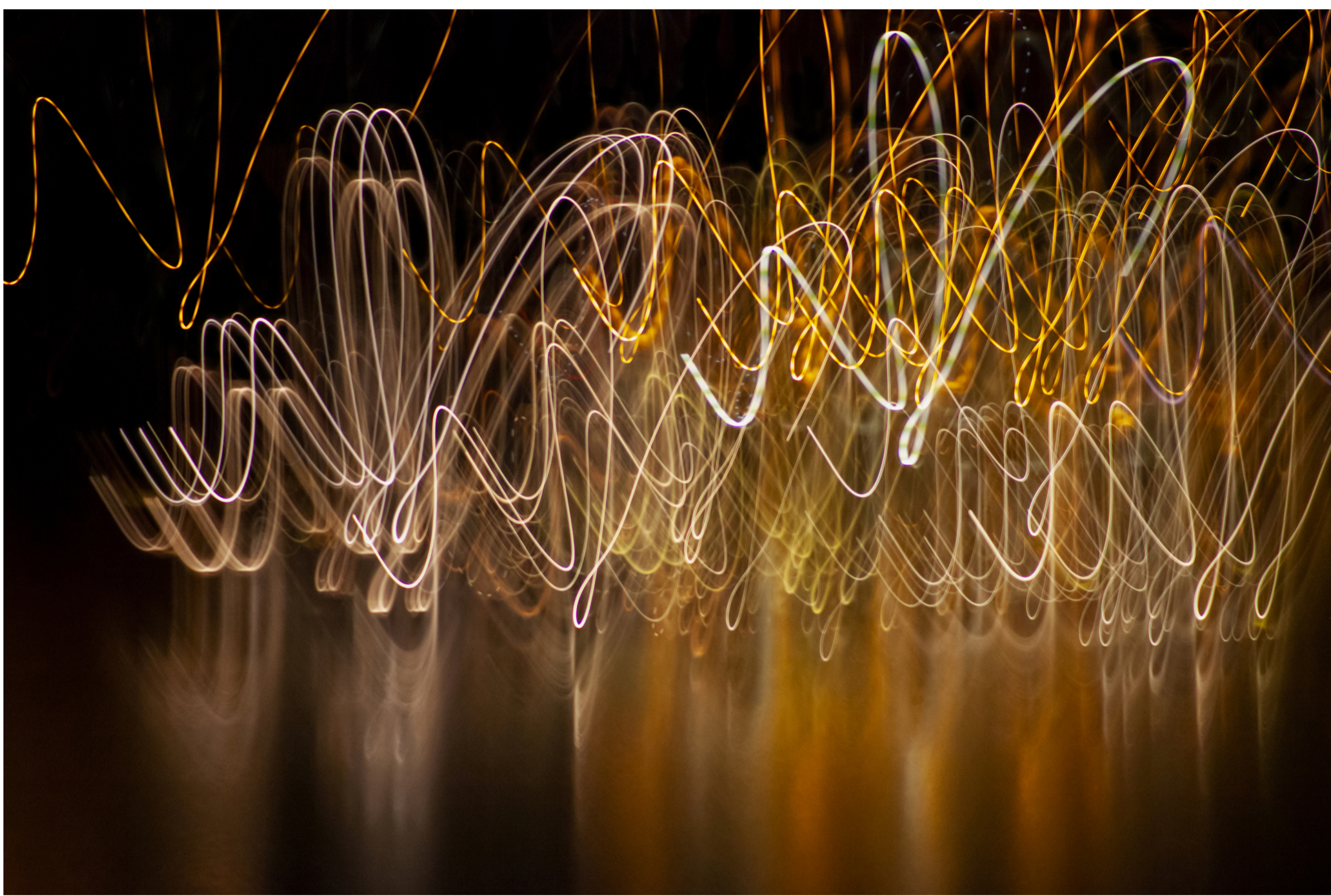
《黑夜书法 #15》Night's Calligraphy #15, 2024

这些图像属于以下系列：“MARE – 随机拥抱的运动动作”（ICM摄影）；“黑夜书法”（夜间摄影）；“时间胶囊”、“奇点”和“腐蚀线”（均为微距摄影）。微距摄影在我的作品中始终存在。它能够裁剪和突出那些被细微忽视的元素，这让我着迷。它使我能够进行非常个人化的图像调查，通过图像叙事的构建，可以颠覆某些真相，将细小的细节转化为扩展比例的新现实。