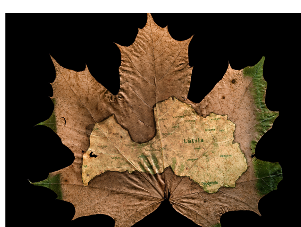
Embodied Extinction Zilvinas Kropas